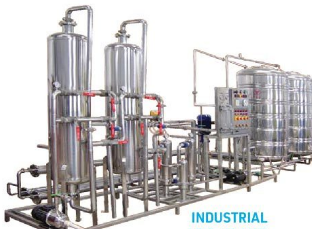
INDUSTRIAL R.O. PLANT