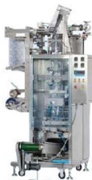
Pouch Packing Machine