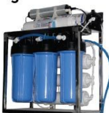
COMMERCIAL R.O. PLANT