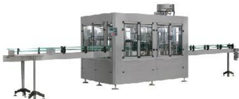
Bottle Filling Machine