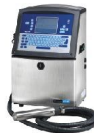
Batch Coding Machine

Also suitable for Schools & Colleges, Hospitals, Offices, Restaurants, Food Processing Units, Apartments etc.