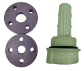
FLANGE & OC STRAINER