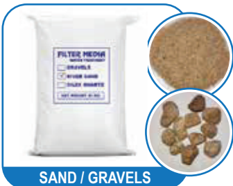
SAND / GRAVELS