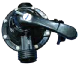
25 NB MPV (TMV)