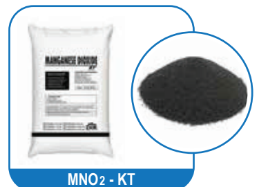
MNO 2 - KT