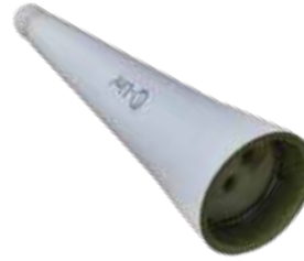
FRP MEMBRANE HOUSING