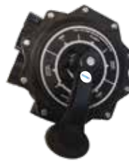
50 NB MPV (SMV)