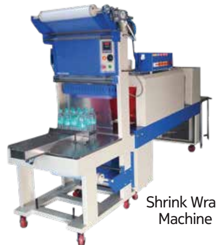
Shrink Wrap Machine