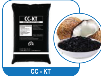
CC - KT