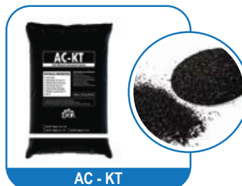
AC - KT