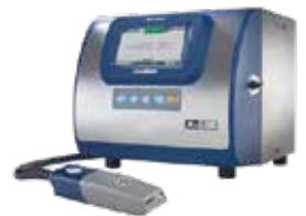
Batch Coding Machine