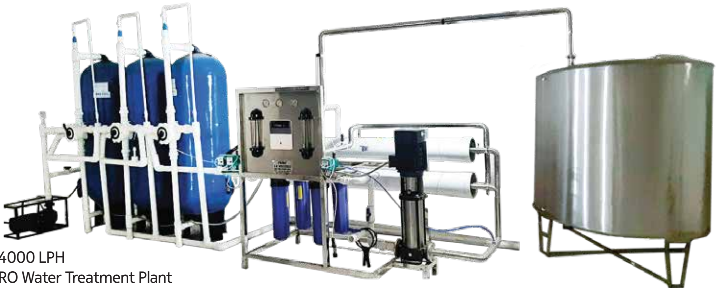
4000 LPH RO Water Treatment Plant

Our specialisation comes in action when it comes to set up Packaged Drinking Water Plant. Our team knows every technical know-how of a ISI marked and BIS approved packaged drinking water plant. We customize the plant according to the production needs starting from 2000LPH and above. Till now we have installed many such plants under the brand FILTRO and all of them are successfully approved by BIS.