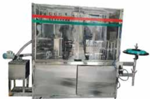
Semi Automatic BOPP Labling Machine