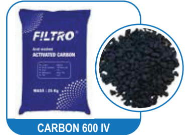
CARBON 600 IV