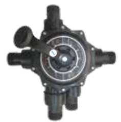
50 NB MPV (SMV)