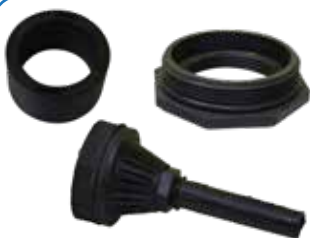
BUSH, ADAPTER, STRAINER