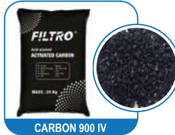
CARBON 900 IV