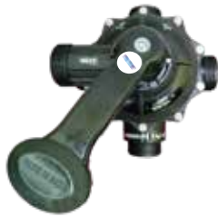
40 NB MPV (SMV)