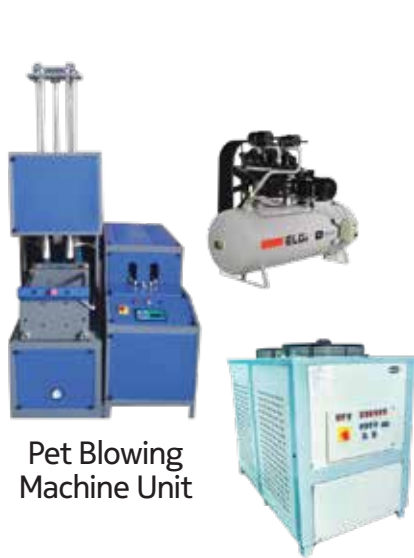
Pet Blowing Machine Unit