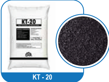
KT - 20