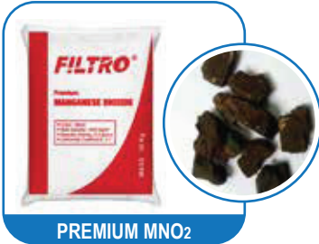
PREMIUM MNO 2