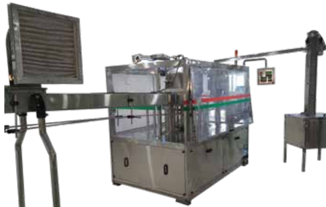
Semi Automatic Rinsing, Filling & Capping Machine