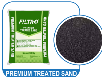
PREMIUM TREATED SAND