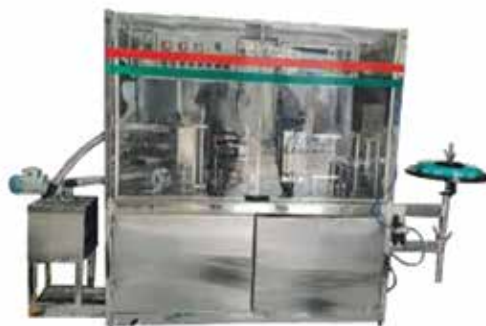
Semi Automatic BOPP Labling Machine